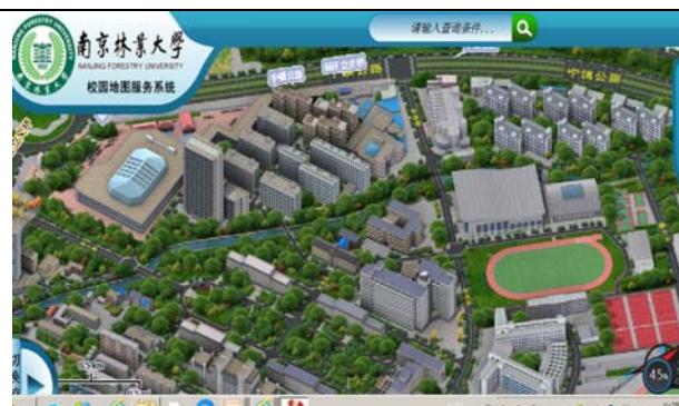
Map of Nanjing Forestry University