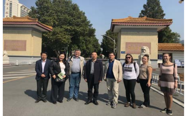
TAURUS coordination experts