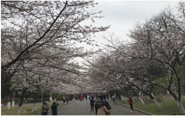
Spring of Nanjing Forestry University