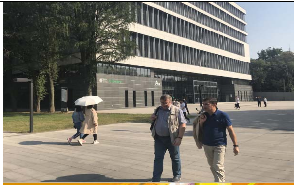
Library of Nanjing Forestry University