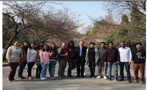
Study in Nanjing Forestry University