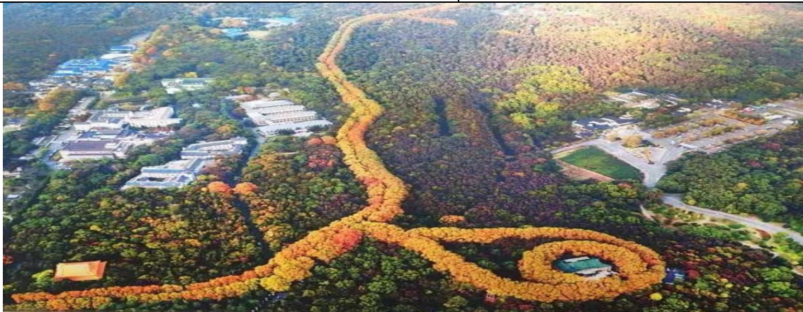
Urban Forest of Nanjing